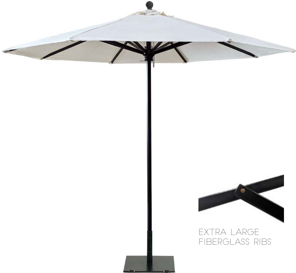
EXTRA LARGE FIBERGLASS RIBS